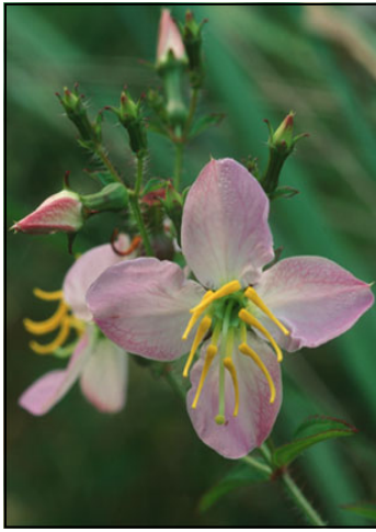
Rhexia mariana