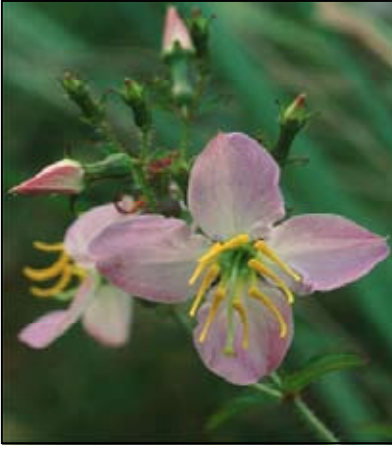
Rhexia mariana