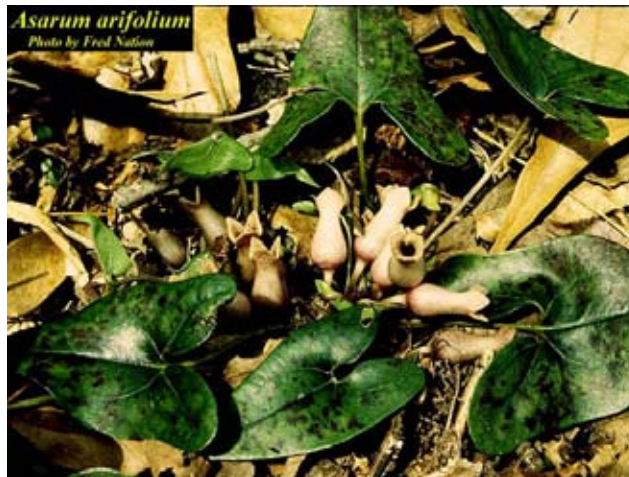
Ginger symbolizes Initiative