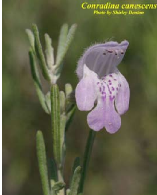
Rosemary symbolizes Dedication

chapter and I ask that you still support what comes next for us. We need your brains, hearts, and hands