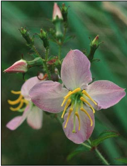
Rhexia mariana