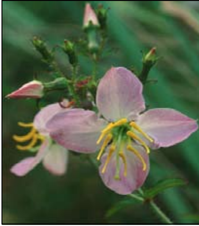
Rhexia mariana